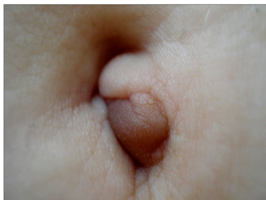
Figure 1 Brown pigmented nodule on the inferior aspect of umbilical area.

The risk of malignant transformation from umbilical endometriosis is low. Wide surgical excision is the treatment of choice, but medical hormonal therapy has also been successfully used to relieve the symptoms and to reduce the size of the endometrial nodule. 3 Primary umbilical endometriosis should always be considered in the differential diagnoses of pigmented nodules on the umbilical region, especially if there is a history of cyclical bleeding, swelling and tenderness during menses.