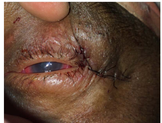
Figure 2 (A) Intraoperatively a strip of 5 mm was formed from the upper eyelid tarsus. (B) Intraoperative finding showing sufficient tightening of both eyelids.