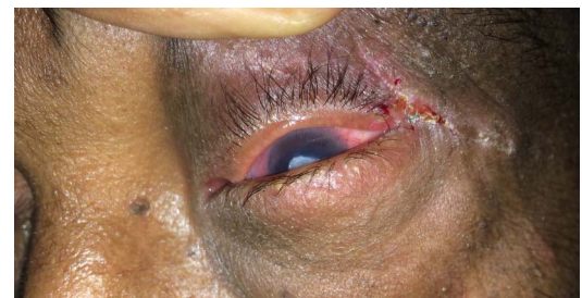
Figure 3 At the end of 1 week, both eyelids having significantly reduced laxity with well-formed lateral canthus.