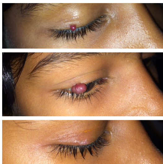
Figure 1 (Top panel) Small reddish mass on the right upper eyelid. (Middle panel) The same mass enlarged over a period of 2 weeks. (Bottom panel) Following complete surgical excision.

Acquired capillary hemangioma of the eyelid is a relatively uncommon condition. Cases occur around puberty and during pregnancy, probably due to hormonal changes, and also in middle-aged men. 1,2 Interestingly, we noticed that our two patients presented with a rapidly enlarging pink to red mass on the right upper eyelid at the junction of the medial two thirds and lateral one third. The second case also showed necrosis at the tip of the lesion. The lesions were pedunculated, making