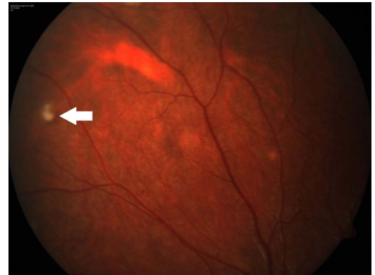
Figure 2 The posterior segment showed preretinal small vitreous infiltrates (arrow).

Following this, the vitreous exudates reduced. The topical and oral steroids were slowly tapered. However, even after 2 months of treatment, the patient is not totally free of inflammation, though the visible hair have drastically reduced in number. We plan to maintain him on a low dose of steroids until the inflammation totally subsides.