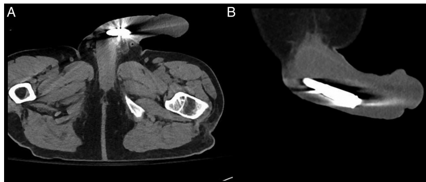
Figure 1 CT scan of the abdomen and pelvis revealing a 2 inch, intact bullet within the penile urethra. (A) Axial view and (B) sagittal view.

Common causes of penile urethral foreign body include auto-erection and psychiatric disorders such as mental retardation and dementia. 1 Foreign bodies in the penile urethra can be a diagnostic challenge. Most patients feel guilty and delay seeking help, so careful history and physical examination are essential. Symptoms may range from lower abdominal pain, swelling or pain in the body of the penis, haematuria, pyuria or urinary retention. 2 An ultrasonogram, pelvic X-ray or CT of the abdomen and pelvis can be useful to identify a foreign body's shape and position. 3 Definitive management includes complete removal of the foreign body with endoscopy, meatotomy, or internal or external urethrotomy. 1 Owing to the association of psychiatric disease, further evaluation is recommended to help prevent future episodes.