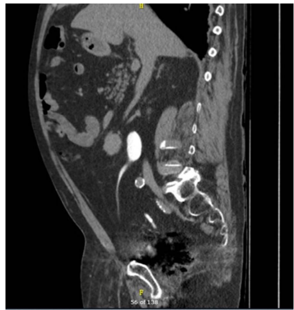
Figure 2 Sagittal view of CT intravenous pyelogram showing dilated proximal right ureter extending down to inguinal canal (arrow). Note that retroperitoneal structures, including the pancreas (A), are sitting forward and extending down into hernia sac (B).