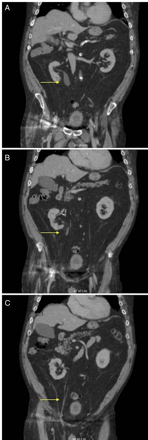
Figure 1 Computed Tomography (CT) intravenous pyelogram showing a partially dilated right ureter extending down towards a right inguinal hernia (arrow).