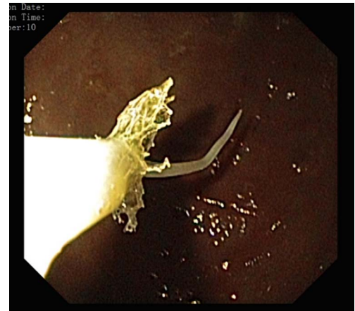
Figure 2 The larva was removed with a Roth net.

Anisakiasis is a zoonosis caused by nematode parasites of the genus Anisakis . 1 It is caused by the consumption of contaminated raw or undercooked fish or seafood. 2 Most of the cases were described in Japan due to food habits; however, it has been increasingly recognised in Western countries. 2-3 Patients can have allergic symptoms like angioedema, urticarial and anaphylaxis. 1 Gastrointestinal symptoms include abdominal pain, nausea and vomiting and complications like digestive bleeding, bowel obstruction, perforation and peritonitis can also arise. 1 Patients can have a low-grade fever. 1 A severe leucocytosis can be present, but peripheral eosinophilia is rare. 3 Three clinical patterns of the gastrointestinal tract involvement were described and all of them can mimic an acute surgical abdomen: (1) gastric acute form in which endoscopic removal of the larva is a curative treatment; 1-2 (2) intestinal form with an acute or chronic presentation, a more challenging diagnosis