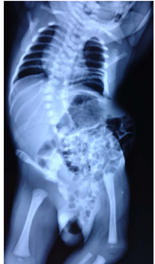
Figure 2 Costo-vertebral anomalies, scoliosis, bowel loops in lumbar and inguinal hernia sac.