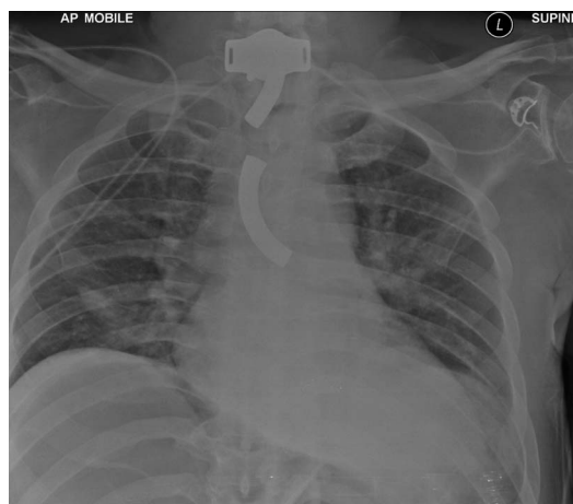
Figure 1 Chest X-ray demonstrating dislodged metal outer cannula resting in the left main bronchus. The metal base plate and remaining inner tube of the tracheostomy can also be seen.

The fracture of silver tracheostomy tubes is rare, but has previously been reported in the literature. 1 Up to 70% of these cases involve metal (silver, copper, nickel or zinc) tracheostomy tubes. 2 As in this case, the fracture generally occurs at the junction between the base plate and outer cannula (figure 3). Fractures are in this location in over 80% of cases, irrespective of tube type. 3