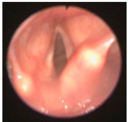
Figure 4 Six weeks postprocedure endoscopic view. The mucosal covering of the vocal folds had completely re-epithelialised.