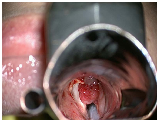
Figure 1 Implant extrusion into airway with associated granulation tissue presenting a potential airway compromise.

This was a popular technique for vocal cord medialisation. However, the current favoured technique is injectable materials such as hyaluronic acid. 1 Complications such as rejection and extrusion of Gore-Tex implants following external approach thyroplasty have been reported at early stages but literature review did not reveal such a late manifestation. 2 This case is important because it highlights