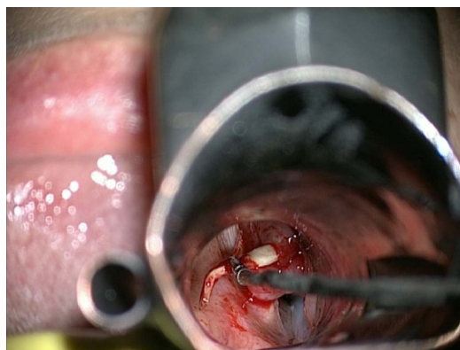
Figure 2 The implant is removed intact endoscopically with a standard microlaryngoscopy set up and jet insufflation.