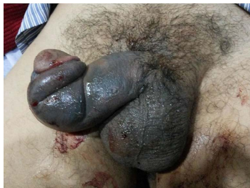
Figure 1 Penis showing dorsal penile angulation with a ventral swelling and ecchymoses of the shaft, called 'eggplant deformity'.

diagnosis is usually clinical and requires prompt surgical intervention. 3 Sometimes, the presentation may be occult and the patient may present with pain with or without swelling. Point of care ultrasound helps in confirming the diagnosis, aiding the surgeon to locate the site of incision with the least chance of neurovascular injury and skin necrosis. Ruptures of the dorsal penile artery and veins are the most common mimics of penile fracture, and can easily be ruled out by an ultrasound, thus avoiding negative exploration.