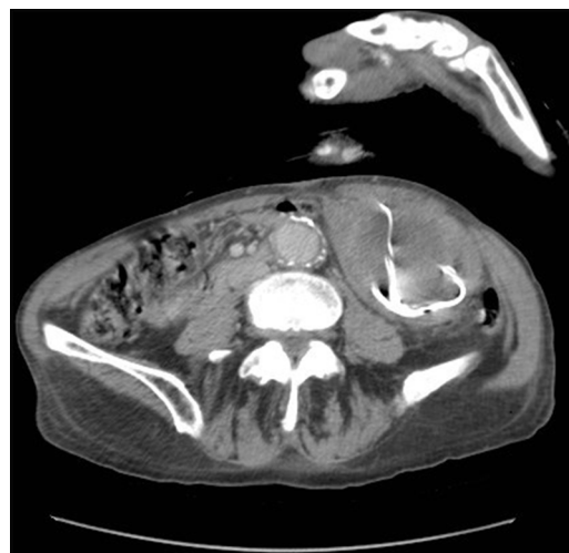
Figure 2 Left abdominal para-aortic heterogeneous mass with hyperdense core (barium impregnated threads) in axial bone and soft tissue windows.

While this patient was asymptomatic, retention of such concealed foreign bodies involves potential risks to the patient in the long term. Complications include infection and abscess formation, in some cases even presenting decades after surgery. 2 Other risks include adhesion formation with consequent obstruction, as well as fistula formation and migration. Furthermore, the diagnostic uncertainty posed by fragmented or degenerated materials that produce less characteristic imaging can also encourage diagnostic delay and misdiagnosis as abscesses, 3 or neoplastic lesions. Given the potential for such complications, surgical removal of such materials should be strongly considered; however, in this case, this was not appropriate, given the poor physical condition of the patient at the time of writing.