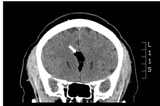
Figure 3 Brain CT—coronal plane, white arrow shows a large, well-defined low-density lesion involving the genu and body of the corpus callosum.