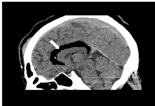
Figure 1 Brain CT—sagittal plane, white arrow shows a large, well-defined low-density lesion involving the genu and body of the corpus callosum.