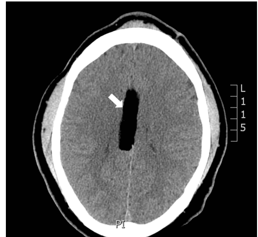
Figure 2 Brain CT—horizontal plane, white arrow shows a large, well-defined low-density lesion involving the genu and body of the corpus callosum.

Owing to the fact that the patient had transient amnesia that could not be explained, a brain CT was ordered, which showed an extensive lipoma of the corpus callosum (figures 1–4). This was interpreted as the cause of a possible epileptic fit that resulted in a transient loss of consciousness, which subsequently led to his accident. The patient was discharged home on anti-epileptics without surgery.