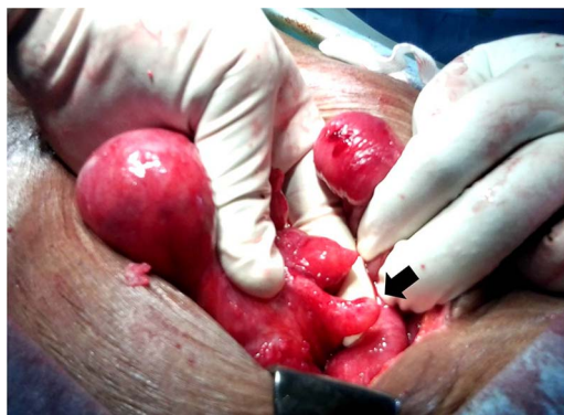
Figure 1 The residual inflamed stump of the appendix is clearly seen (arrow) after separation of the adherent small bowel.