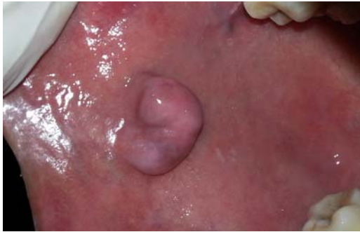
Figure 1 Swelling on the right buccal mucosa near the lip commissure.

18-year-old boy presented to our outpatient Department of Periodontology, Teerthanker Mahaveer Dental College and Research Centre, with a 5-month history of painless swelling on the right buccal mucosa near the lip commissure (figure 1). On examination, the swelling was well defined, smooth and oval shaped, measuring 2×2 cm. It was fluctuant, firm and non-tender on palpation. A provisional diagnosis of mucocele was established. An excisional biopsy was performed. Histopathological slides showed round-to-ovoid shaped tumour cells having vesicular nuclei with prominent nucleoli and deep eosinophilic cytoplasm arranged into groups and sheets (figure 2). The overall features indicated low-grade mucoepidermoid carcinoma of minor salivary gland.