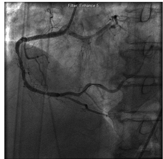
Figure 2 Appearance of right coronary artery after percutaneous transluminal coronary angioplasty.

from chest pain and discharged uneventfully. Single coronary artery anomalies are usually benign and asymptomatic. If a patient with single coronary artery anomaly has a heart attack, routine percutaneous intervention should be performed.