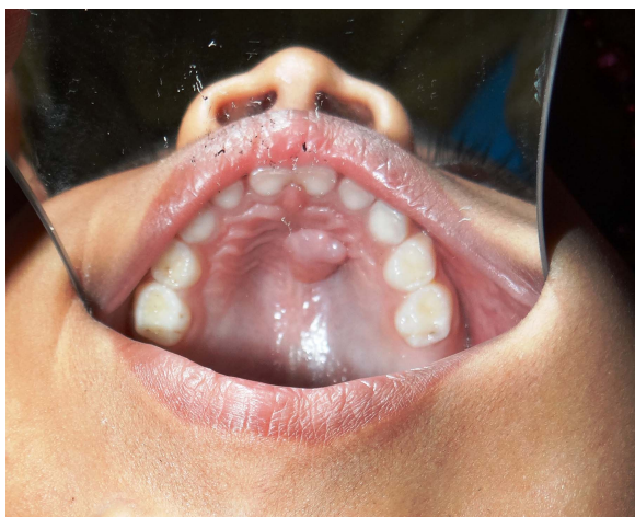
Figure 3 Recurrence of a similar swelling at an anterior site.

Haemangiomas are benign tumours of the blood vessels and are classified according to their histopathological appearance as capillary, mixed cavernous, or sclerosing, a variety that tends to undergo fibrosis. 8 Haemangiomas grow by endothelial hyperplasia and should be differentiated from vascular malformations, which are not true neoplasms but are localised defects of vascular morphogenesis caused by dysfunction in embryogenesis and vasculogenesis. 4 Haemangiomas are the most common benign soft tissue tumour of infancy and childhood, occurring in 12% of all infants, and are found in greater frequency in girls, white children, premature infants, twins, and those born to mothers of higher maternal age. 8 The incidence in the Indian population has not been reported. 9 Haemangiomas occur frequently in the head and neck region (60%), followed by the trunk (25%) and the extremities (15%), and are grouped into infantile haemangi-