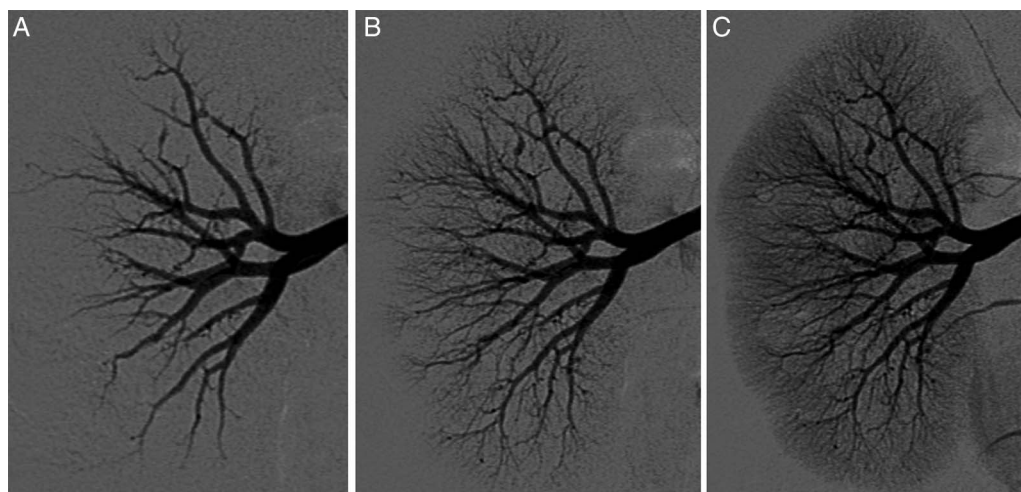
Figure 1 Right selective renal arteriography ((A–C) from early to late phase, respectively) showing several microaneurysms, segmental narrowing and variations in the calibre of arteries in medium-sized and small-sized renal arteries.

The patient was treated with corticosteroids, ramipril, hypocoagulation and monthly intravenous cyclophosphamide followed by azathioprine, and is currently asymptomatic, without significant deficits.