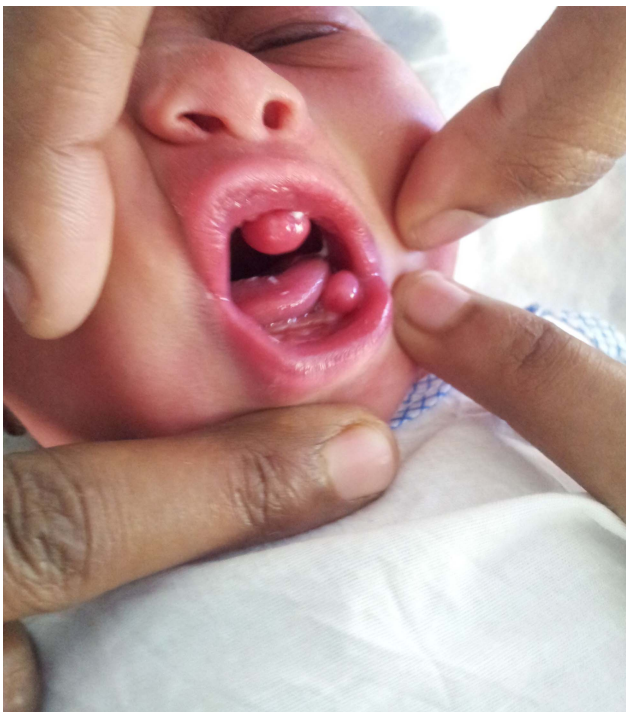
Figure 2 Two large pedunculated masses on the maxillary and mandibular alveolar ridges in a neonate female. Maxillary mass 2×2×1.5 cm in size and mandibular mass 1.5×1.5×1 cm in size.

Histology shows polygonal cells with pink, PAS-positive granular cytoplasm and regular, round, dark basophilic-staining nuclei. 6 The recommended treatment is prompt surgical resection. These tumours have very good prognosis. 7