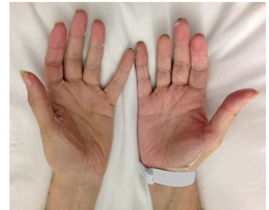
Figure 2 Epithelial desquamation affecting the palmar aspect of both hands.

Systemic antibiotic therapy is a major cause of severe cutaneous adverse reactions—a spectrum of mucocutaneous hypersensitivity disorders including Stevens-Johnson syndrome and toxic epidermal necrolysis. 1 Although the exact pathogenesis is not fully understood as yet, these rare but life-threatening disorders are thought to result from cytotoxic T-lymphocyte-mediated keratinocyte apoptosis in genetically predisposed patients. 2 3 Severe cases are at further risk of developing