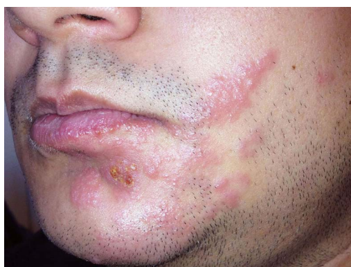
Figure 1 Cutaneous lesions of mandibular zoster on the cheek, the lower lip and the chin, all limited to the left side.

The branch of the trigeminal nerve which is most often affected is the ophthalmic nerve. Mandibular nerve involvement is much rarer and