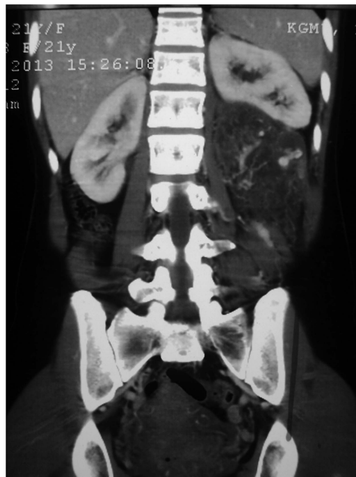
Figure 1 CT angiogram showing heterogeneously enhancing soft tissue lesion with multiple dilated tortuous vascular channels involving layers of posterior abdominal wall, compressing and displacing the left kidney anteriorly and superiorly.

dilated tortuous vascular channels involving layers of posterior abdominal wall, compressing and displacing the left kidney anteriorly and superiorly (figures 1 and 2). It was fed by all four left lumbar arteries and draining into the left common iliac vein suggestive of AVM (figure 3). She underwent transarterial coil embolisation followed by surgical resection of AVM. The patient is doing well at 2-month follow-up without any recurrence.