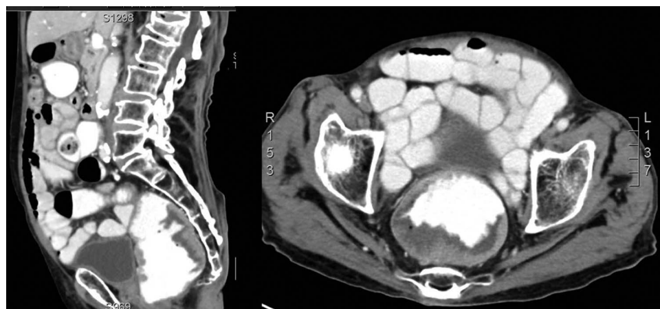
Figure 1 CT with contrast, axial and sagittal section showing thickening of the rectal wall.

X-rays of the abdomen in supine and sitting positions, showing the massive pneumoperitoneum with its classic signs described (figure 2A, B). The patient suffered from respiratory distress and underwent shock. Immediate resuscitation was followed by transfer to the operating theatre and exploration was performed. It revealed a large colonic perforation, more than half of the circumference with no gross contamination of the