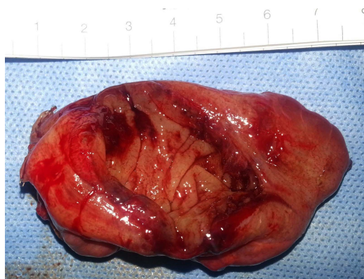
Figure 3 The surgical specimen of the sigmoid showing the large perforation (4 cm) at antimesenteric border.

peritoneum (figure 3). The decision was to perform Hartmann's procedure, resecting the perforated segment, closing the distal stump and performing end colostomy. The biopsy revealed tubovillous adenoma. The patient had an extended post-operative intensive care unit stay with prolonged intubation, which ended in respiratory failure with further compromise of the cardiac functions. The patient died after approximately 2 months.