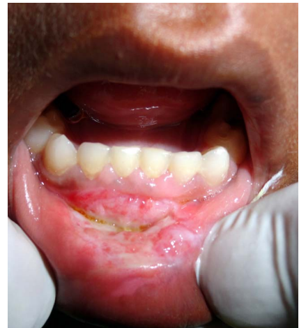
Figure 4 After 1 week postoperative.