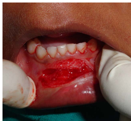
Figure 2 After incision.