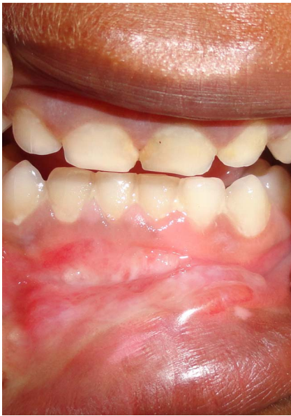
Figure 6 3 months postoperative.

particularly destructive because of their lytic action on tissues. Various treatment options may be offered to patients with caustic acid ingestion, like topical and intralesional corticosteroids, commissuroplasties, mucosal flaps, free radial