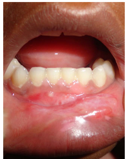
Figure 5 1 month postoperative.

To cite: Rallan M, Malhotra G, Rallan NS, et al. BMJ Case Rep Published online: [please include Day Month Year] doi:10.1136/bcr-2013-009083