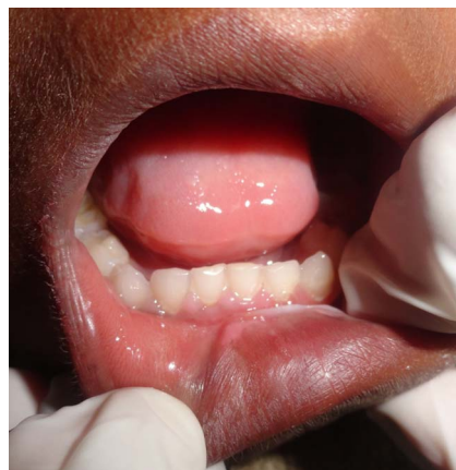
Figure 1 Preoperative.