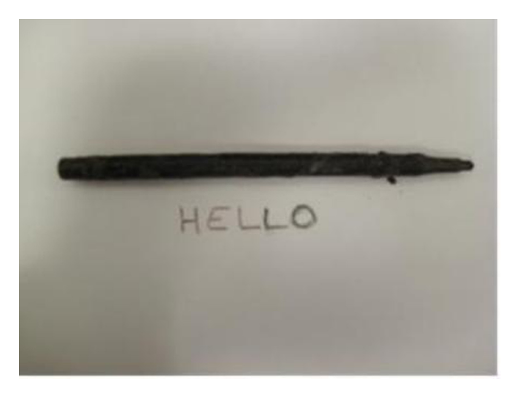
Figure 2 Felt-tip pen still in working order after 25 years in stomach acid.

This pdf has been created automatically from the final edited text and images.