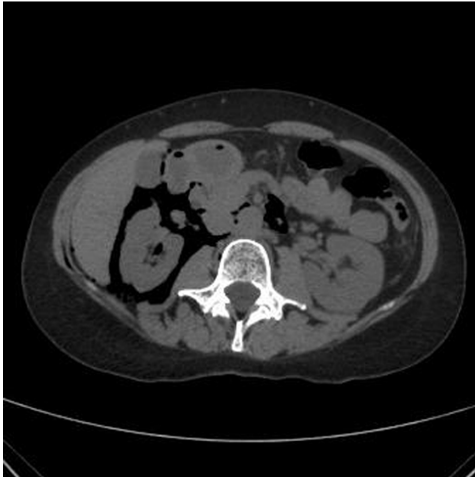
Figure 2 CT scan showing right-sided retroperitoneal but no intraperitoneal air.

with parenteral antibiotics and nil per os for 2 days and the patient could be discharged after 3 days of observation with clinical resolution of both cutaneous emphysema and pain in the neck.