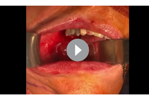
Video 1 Intraoperative video of gas escaping during drainage of abscess.

Following the initial drainage, there was continued pus production from all drain sites necessitating a further surgical intervention involving two general anaesthetics, two intravenous sedations and two local anaesthetic drainage procedures. She remained an inpatient for 25 days, with use of 5 antibiotics under advice of microbiology (clindamycin, metronidazole, vancomycin, doxycycline