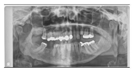
Figure 1 Panoramic radiograph showing carious lower right 5 and lower right 7, with periapical pathology associated with both teeth. The radiopacities in the right mandible reveal a chronic sclerosing osteitis, indicative of a long standing infection. Gas is also seen in the soft tissues around the right ramus.

Given the swelling extent, it was not surprising that frank pus was expressed through the extraction socket into the oral cavity following removal of LR7. What was surprising, however, was the presence of bubbles, representing escaped gas from the widespread subcutaneous emphysema passing through the pus (video 1).